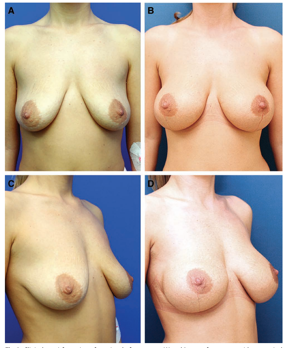
Fig. 2. Clinical case I: front view of a patient before surgery (A) and 2 years after surgery with anatomical Style 510 textured implants (Allergan) of 385 cc and dual-plane technique (B). Clinical case I: lateral view of a patient before surgery (C) and 2 years after surgery with anatomical Style 510 textured implants (Allergan) of 385 cc and dual-plane technique (D).

Ten cases of unsatisfactory breast shape in the outer lateral inferior quadrant emerged about 6 months after the surgery. These cases of pseudo-ptosis were settled with lipofilling sessions.